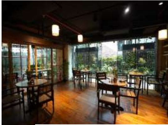
Figure 2 Happiness Cafe

hospitality, dining, wellness, fitness and social engagement under one roof to provide members with an unparalleled premium experience.