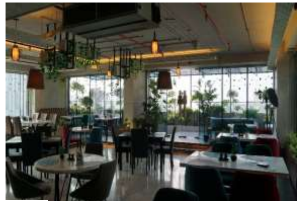
Figure 1 Aandaz Restaurant