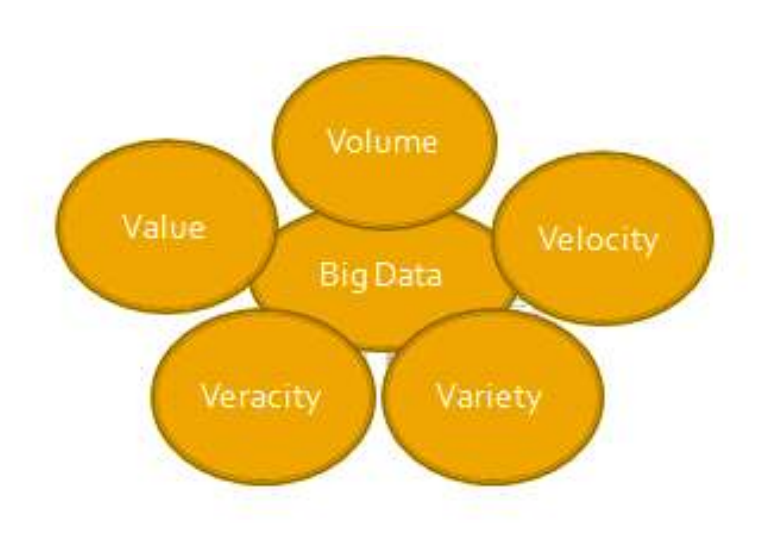
Figure 1.1: 5V's of Big Data.

- Big data technologies describe a new generation of technologies and architectures, designed to economically extract value from very large volumes of a wide variety of data, by enabling high-velocity capture, discovery, and/or analysis [4].