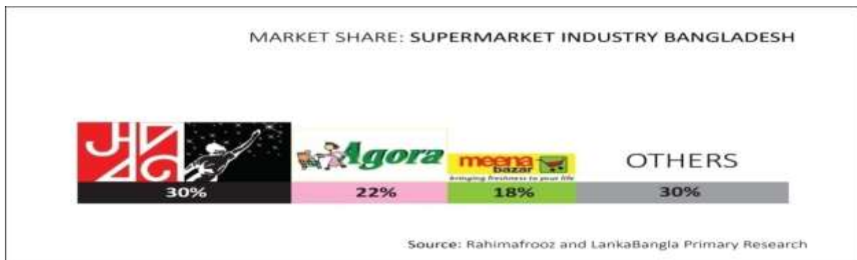
Figure- 2.3: Market Share of Super Market Industry Bangladesh

Shwapno has the highest market share with highest number of outlets which is 59 outlets. Agora has 14 outlets and Meena Bazar has 17 outlets in Bangladesh.