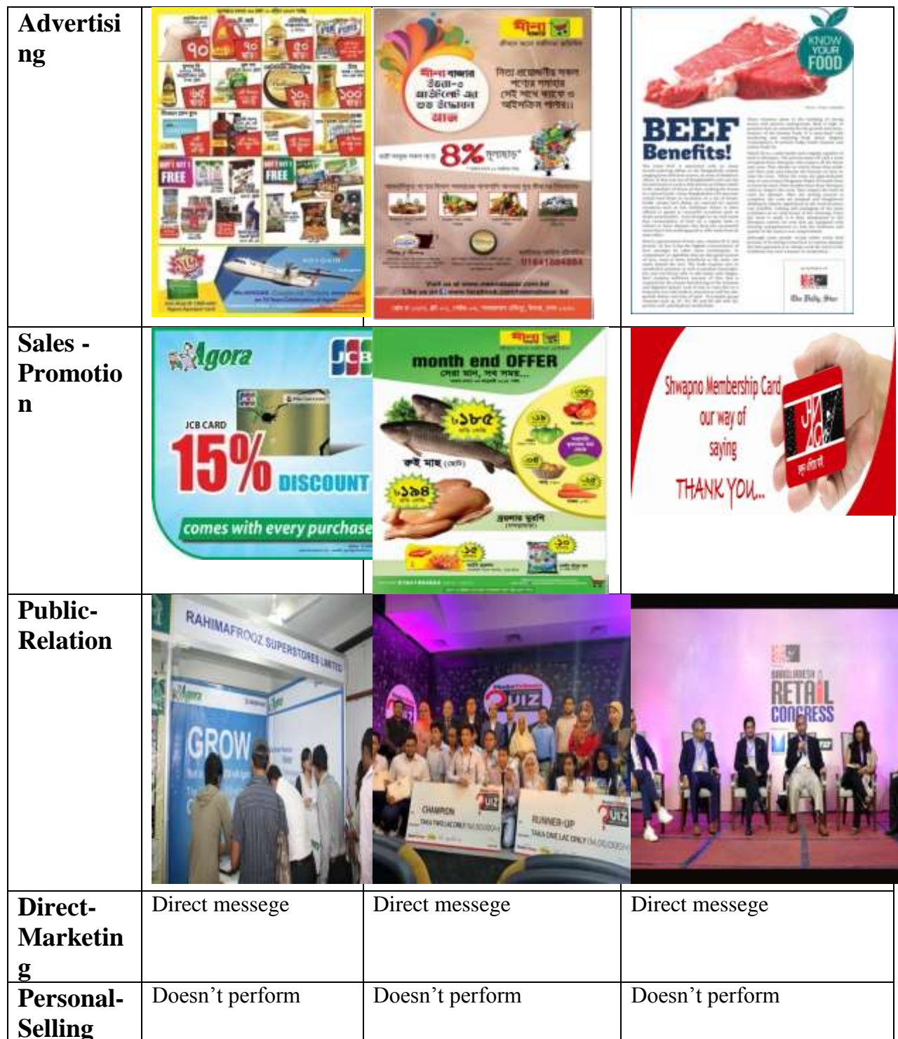
Table- 4.1: Examples Of Promotional Tools Of The Retail Brands